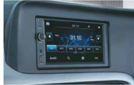
17.14cm (6.75") touchscreen display audio

Other features: 3 Point seat belts (All seats) | Seat belt reminder (All seats) | Headlamp escort system Burglar alarm | TPMS - highline | 6 Airbags