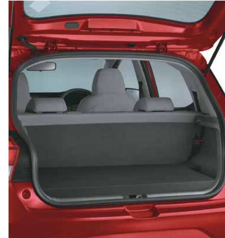
Spacious boot with company-fitted dual cylinder CNG

Hyundai Grand i10 NIOS Hy-CNG duo is engineered to optimize every journey. Equipped with a dual-cylinder system, it offers more boot space and fuel efficiency. It ensures you have all the room you need for your adventures while delivering exceptional performance.