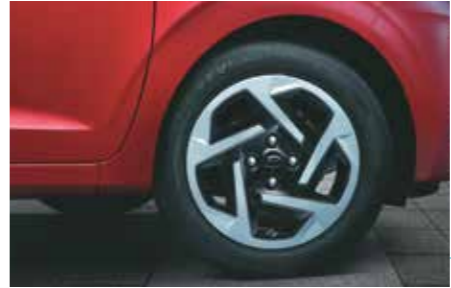
R15 (D = 380.2mm) Dual tone styled steel wheel