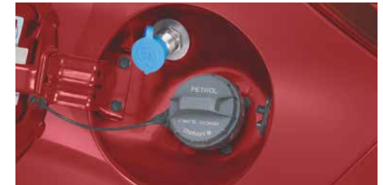
Convenient CNG filling with fast refuelling nozzle (near petrol filling area)